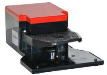
One pedal, with pedal actuator lock - open KG120