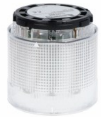
Signal tower Ø70mm/2.75" 8TL7