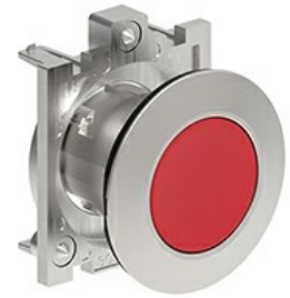
Push-push button actuators LPFQ10