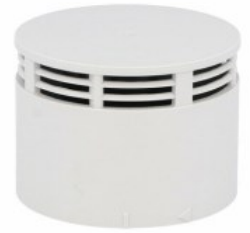
Signal tower Ø70mm/2.75" LTN70