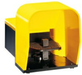
One pedal, with pedal actuator lock - with cover KG220