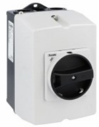
Surface mount enclosures IP65 (4X) for SM1R SM1Z Surface mount enclosures IP65 (4X) for SM1R SM1R...