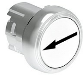
Pushbutton actuators, spring return, with symbol LPSB11