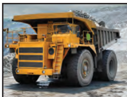
Specialty Trucks, such as Dump Trucks, Garbage Trucks, Concrete Trucks, Utility Trucks