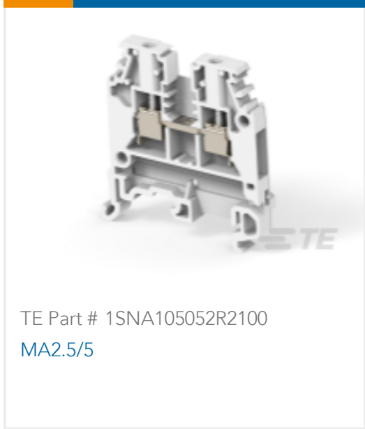
TE Part # 1SNA105052R2100 MA2.5/5