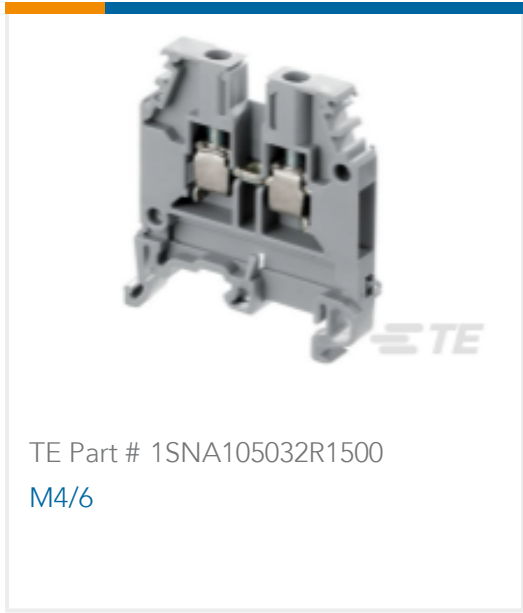
TE Part # 1SNA105032R1500 M4/6