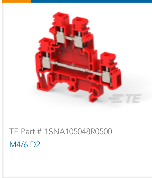
TE Part # 1SNA105048R0500 M4/6.D2