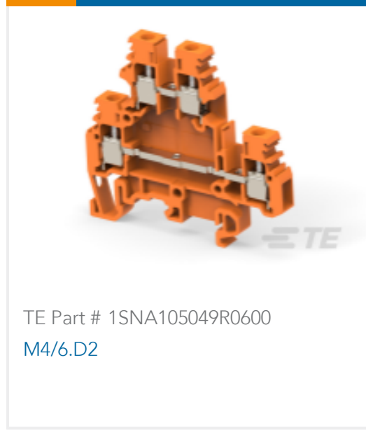
TE Part # 1SNA105049R0600 M4/6.D2