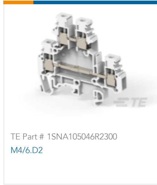
TE Part # 1SNA105046R2300 M4/6.D2