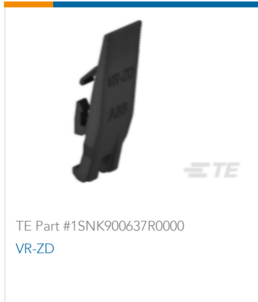
TE Part #1SNK900637R0000 VR-ZD