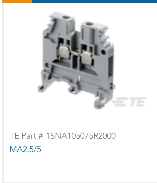
TE Part # 1SNA105075R2000 MA2.5/5