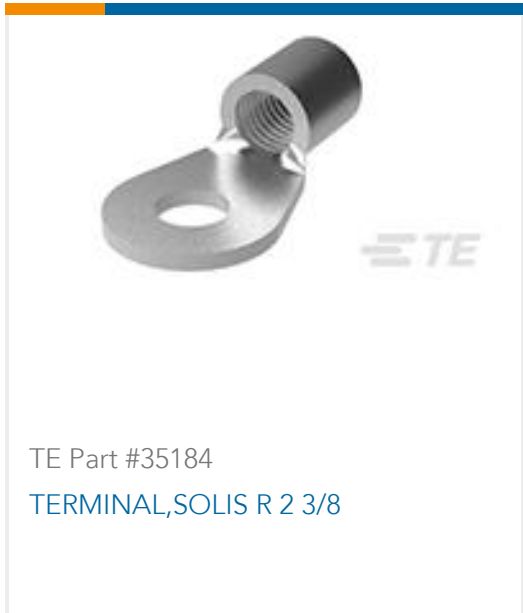
TE Part #35184 TERMINAL,SOLIS R 2 3/8