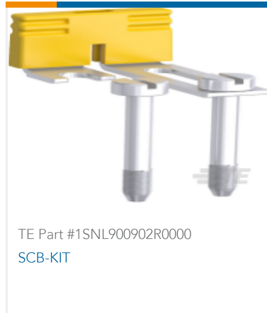
TE Part #1SNL900902R0000 SCB-KIT