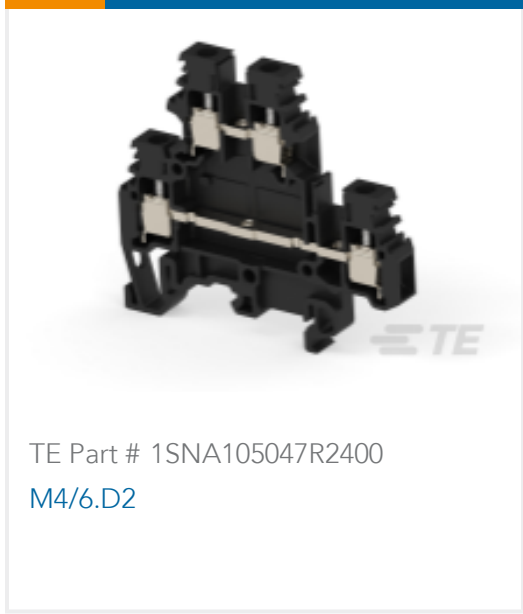
TE Part # 1SNA105047R2400 M4/6.D2