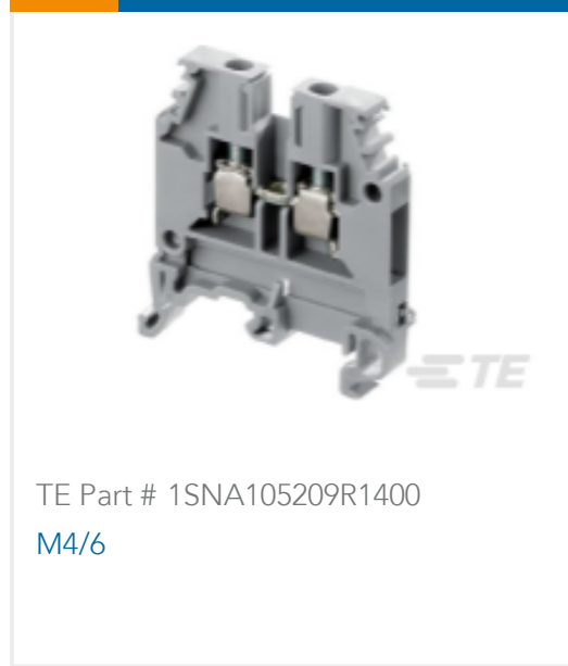
TE Part # 1SNA105209R1400 M4/6