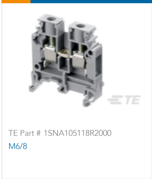
TE Part # 1SNA105118R2000 M6/8