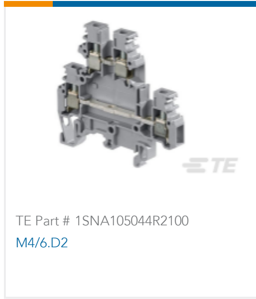
TE Part # 1SNA105044R2100 M4/6.D2