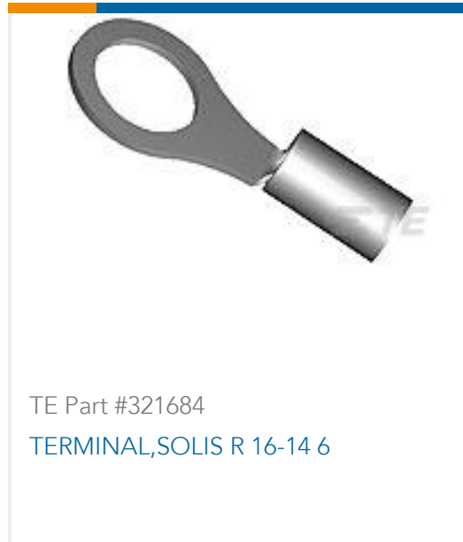
TE Part #321684 TERMINAL,SOLIS R 16-14 6