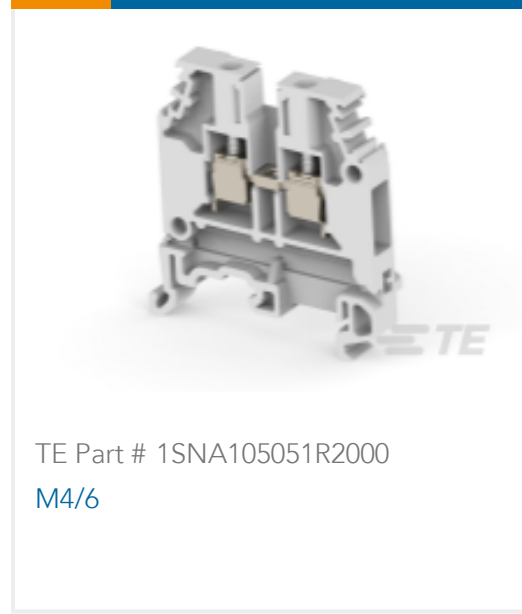
TE Part # 1SNA105051R2000 M4/6