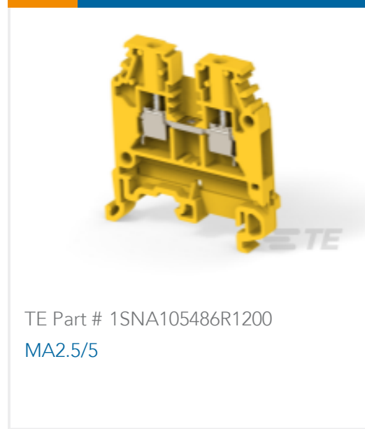
TE Part # 1SNA105486R1200 MA2.5/5