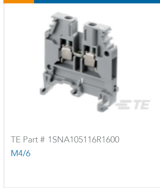
TE Part # 1SNA105116R1600 M4/6