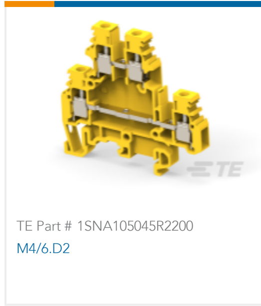
TE Part # 1SNA105045R2200 M4/6.D2