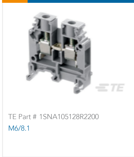
TE Part # 1SNA105128R2200 M6/8.1