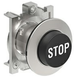
Pushbutton actuators, spring return, with symbol LPFB21