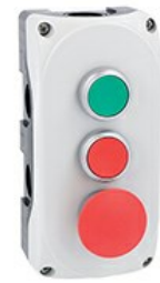
Grey control station LPZP3A8 complete with green flush pushbutton LPCB103 1NO, red flush pushbutton LPCB104 and mushroom pushbutton spring return LPCB6144 LPZP3B8912