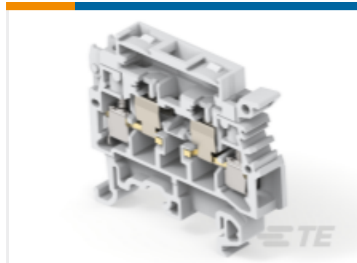
TE Part #1SNA115657R2500 M4/8.SF