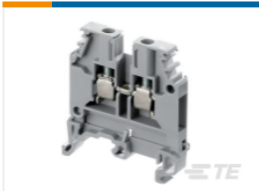
TE Part #1SNA105032R1500 M4/6