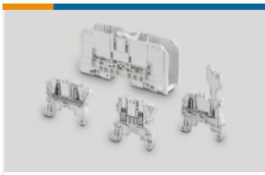
Modular Terminal Blocks(182)