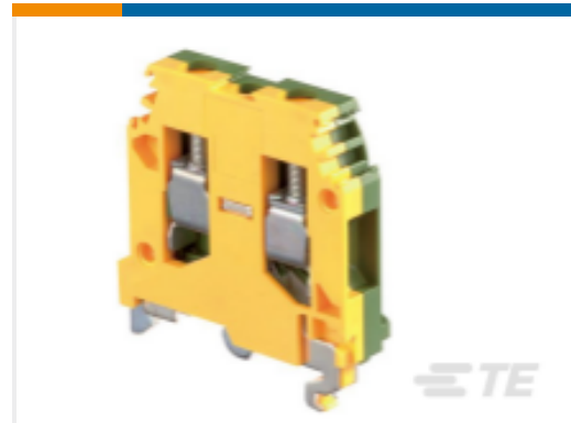
TE Part #1SNA165114R1700 M6/8.P