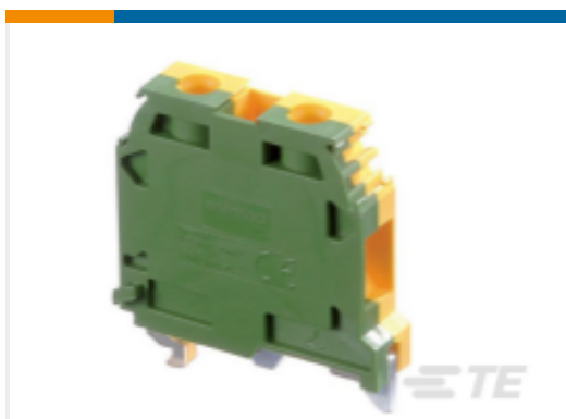
TE Part #1SNA165115R1000 M10/10.P