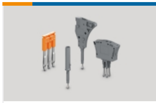
Terminal Block & Strip Conducting Accessories(26)