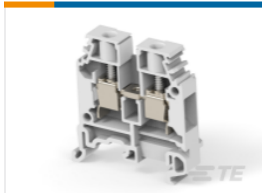
TE Part #1SNA115118R1100 M6/8