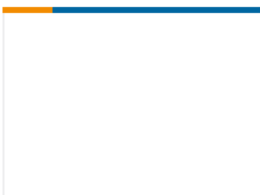
TE Part #1SNA176667R0400 BJMI6-10