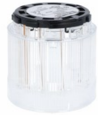
Signal tower Ø70mm/2.75" 8TL7FL - Light modules