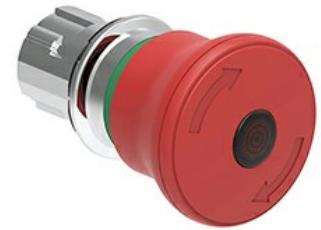
Illuminated mushroom head button actuators - Latch, turn to release Ø 40mm/1.6" LPSBL66