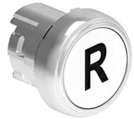
Pushbutton actuators, spring return, with symbol LPSB11