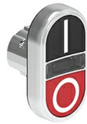
Double-touch actuators, spring return white indicator - Two flush pushbuttons LPSBL71