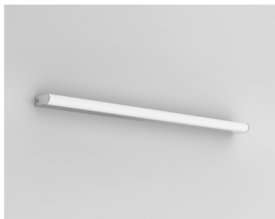
CODE: 1308007 FINISH: POLISHED CHROME

To maintain this product to its best condition, please view our care and cleaning guide on the support section of the astro website.