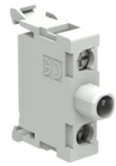
LED elements steady light base mount on LPZ control station LPXLPB