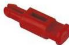
CR CDS coding pin