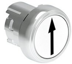
Pushbutton actuators, spring return, with symbol LPSB11