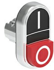
Double-touch actuators, spring return - One extended and one flush pushbuttons LPSB72