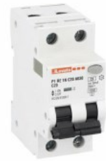
Residual current circuit breakers (RCCB) with overcurrent protection P1RE 1P+N 2 IEC