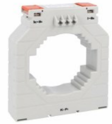
Current transformers DM4T2500 Solid-core