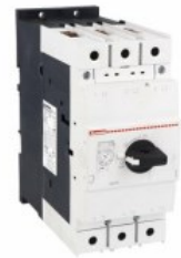
Motor protection circuit breaker SM3R