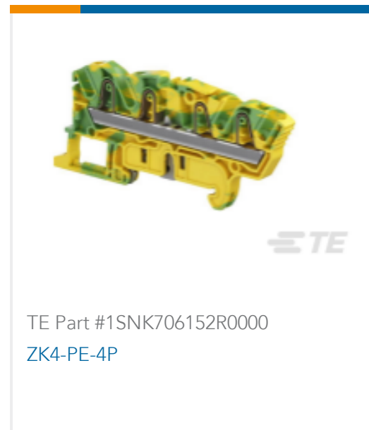
TE Part #1SNK706152R0000 ZK4-PE-4P