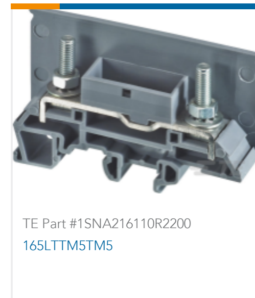
TE Part #1SNA216110R2200 165LTTM5TM5