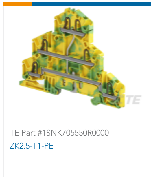
TE Part #1SNK705550R0000 ZK2.5-T1-PE