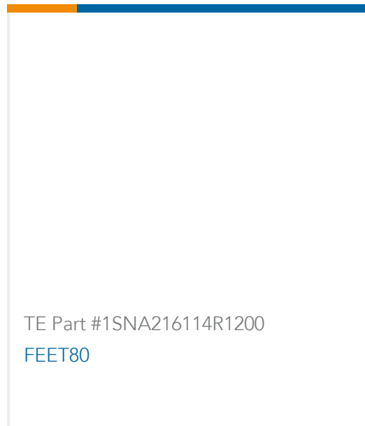
TE Part #1SNA216114R1200 FEET80