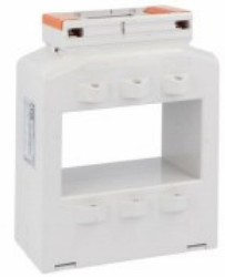
Current transformers DM37T2250 Solid-core