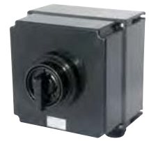
6-pole, 80 A (change-over)