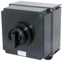
6-pole, 80 A (change-over)