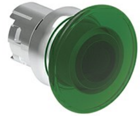
Illuminated mushroom head button actuators - Spring return Ø 40mm/1.6" LPSBL61