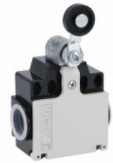
Roller lever plunger KNE