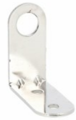
Signal tower Ø50mm/1.97" LTN50