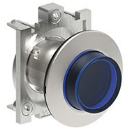
Illuminated push-push button actuators - Extended LPFQL20