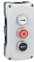
Grey control station LPZP3A8 complete with white flush pushbutton "right arrow" LPCB1148 1NO, red extended pushbutton "o" LPCB2104 1NC and black flush pushbutton "left arrow" LPCB1142 1NO LPZP3B8909