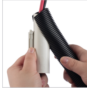
Slide Corrugated Loom Tubing onto end of tool until approximately 3 inches of it covers the bundle.