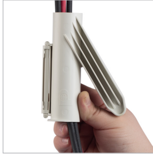
Close tool to contain bundle.