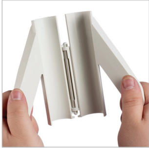
Open tool and insert bundle.