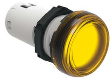
LED integrated monoblock pilot lights steady light LPML