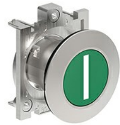
Pushbutton actuators, spring return, with symbol LPFB11