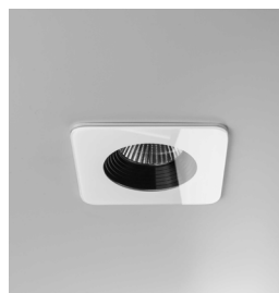
CODE: 1254014 FINISH: WHITE