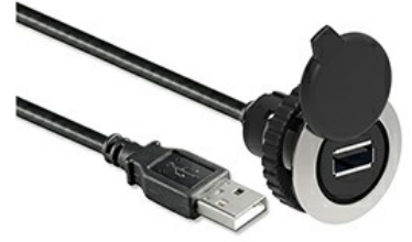
USB interface, A/A female type connection with 1m long cable LPFD0