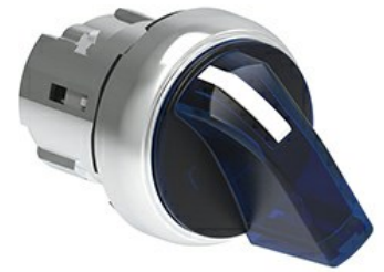
Illuminated selector switch actuator - 3 position LPSSL13