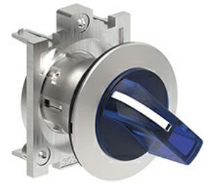
Illuminated selector switch actuator - 3 position LPFSL13