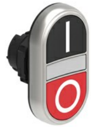
Double-touch actuators, spring return white indicator - Two flush pushbuttons LPCBL71