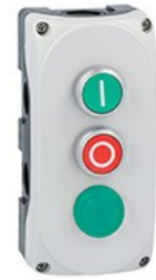
Grey control station LPZP2A8 complete with green flush pushbutton "i" LPCB1113 1NO, red flush pushbutton "o" LPCB1104 1NC and green pilot light 24V LPZP3B8910