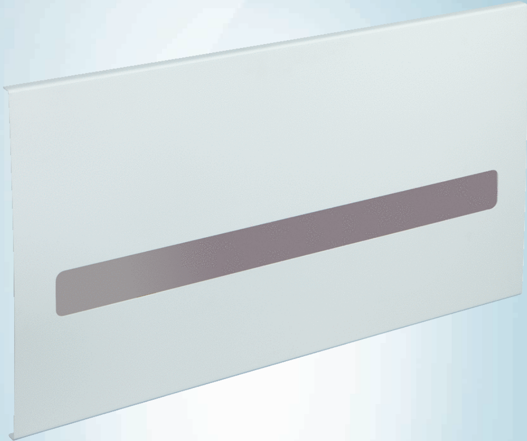
Front plate for trigger