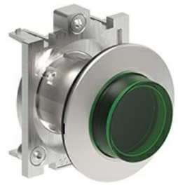
Illuminated button actuators, spring return - Extended LPFBL20