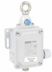
Rope-pull lever with reset button P2L151312