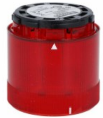
Signal tower Ø70mm/2.75" 8TL7GL - Light modules