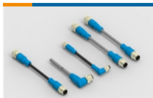
M8/M12 Cable Assemblies(230)