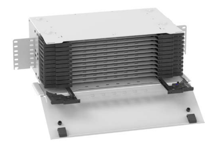
Enclosure with 12 slide out trays