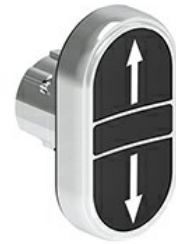
Double-touch actuators, spring return - two flush pushbuttons LPSB71