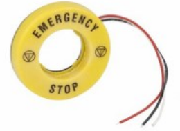
Illuminated disk for mushroom head pushbuttons - EMERGENCY STOP LPXDAU