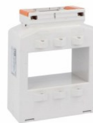
Current transformers DM37T2500 Solid-core